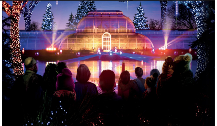
Christmas Lights in front of the Palm House