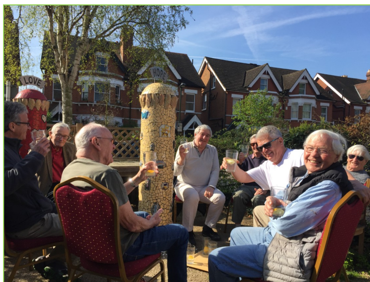
The Men's Wellbeing Group enjoying the garden