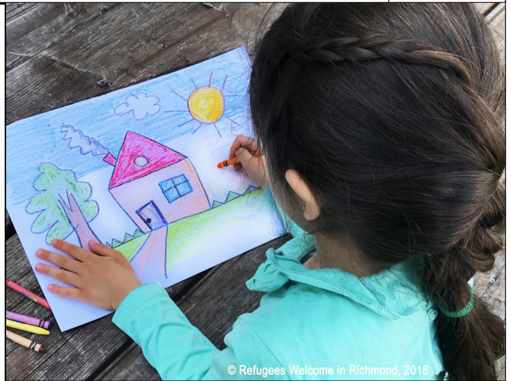
© Refugees Welcome in Richmond, 2018