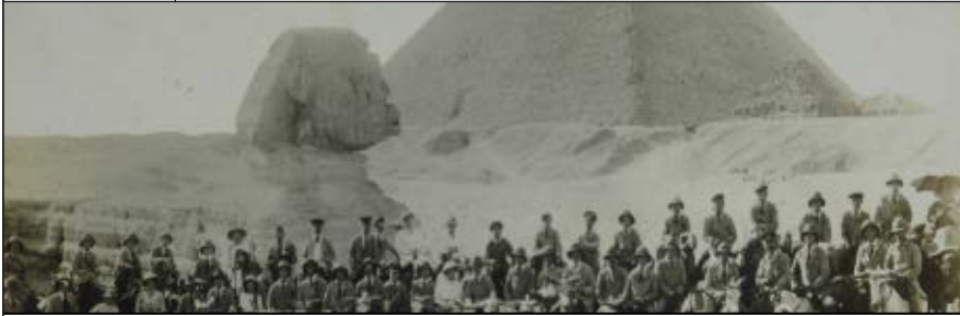
Soldiers in front of the sphinx and pyramid at Giza