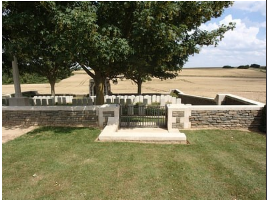
Hillside Cemetery, Le Quesnel