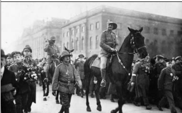
General Von Lettow-Vorbeck leads the "Victory Parade" in Berlin