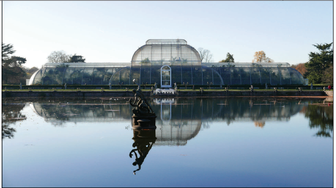
The Palm House

The weather at Kew has been recorded for over two centuries, and its collections of exotic and native plants are among the most diverse in the world. In 2000 a new